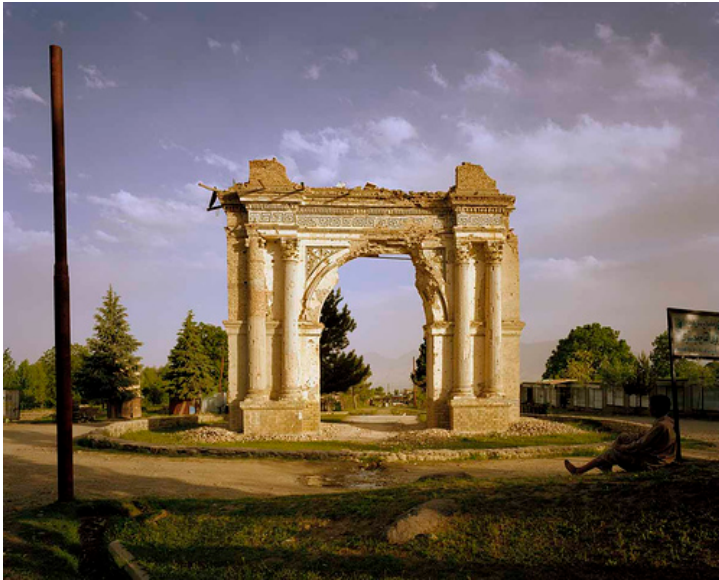
Figure Seven: King Amanullah's Victory Arch from Afghanistan

His Afghanistan photographs formed the basis of his book Afghanistan: Chronotopia , which was published in 2002. The term 'chronotopia' derives from Norfolk's interest in Mikhail Bakhtin's concept of a chronotope – 'a place that displays the 'layeredness' of time.' (Norfolk, 2014B).