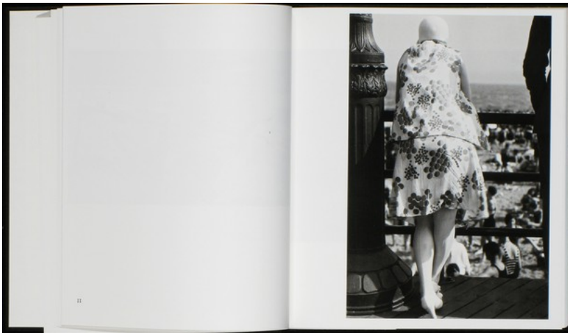
Figure Three: Walker Evans American Photographs Layout

In practice, however, Frank was unable to find a US publisher who was prepared to take on his work and he fell back on the original commitment made by Delpire to publish in France. Delpire decided to publish Les Américains (Frank, 1958) as the fifth work in his series Encyclopie Essentielle , which were quasi-educational books, aimed at introducing French audiences to the history and culture of other countries. The form of presentation was not as Frank had wished, see Figure 4. The images were placed opposite texts from many influential writers selected by Alain Bosquet. In this form the meaning of the photographs was anchored by the probing texts that presented a hostile European view of America.