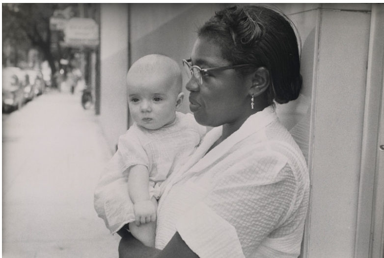
Figure Two: Charleston, South Carolina