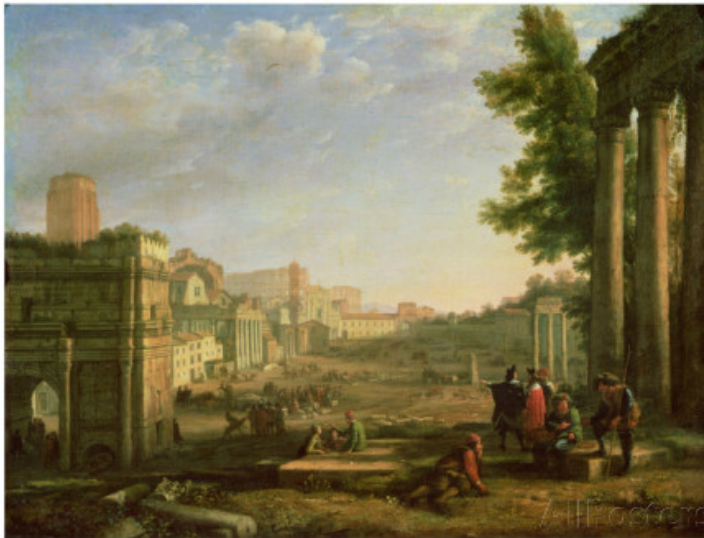
Figure Six: View of the Campo Vaccino, Rome, 1636 by Claude Lorrain