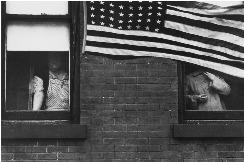
Figure Five: Parade - Hoboken, New Jersey

Some 60-years on Frank's photographs in The Americans seem to resist attempts to pin them down to specific meaning. Perhaps this is as it should be, in line with Frank's original intention to produce a personal response to what he found.