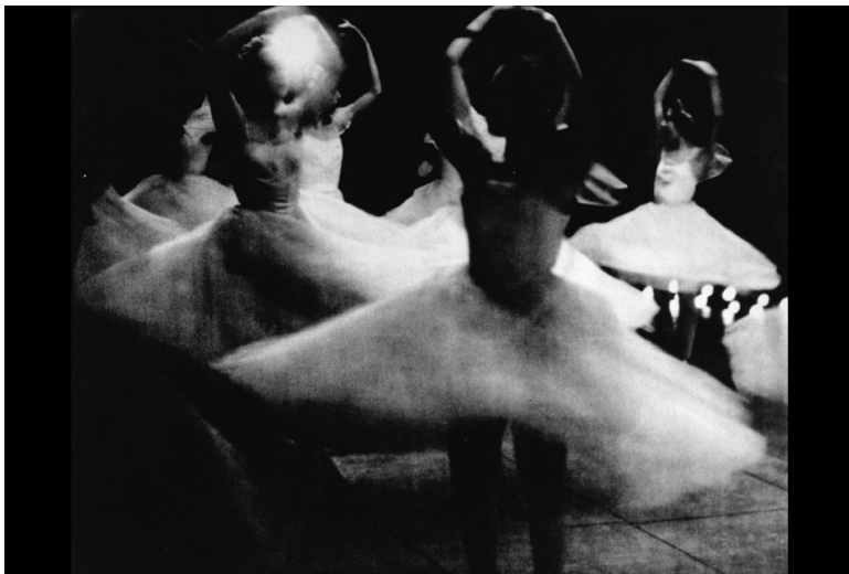
Figure One: Ballet 1945 ©Alexei Brodovitch

Whilst in New York, Frank worked briefly for Harpers Bazaar under Alexei Brodovitch. Brodovitch's expressive style, as epitomized in his book 'Ballet' with its blurry, out of focus, contre-jour images, clearly influenced Frank and many of these aesthetic elements are to be found in his later work (Brodovitch, 1945), see Figure One.